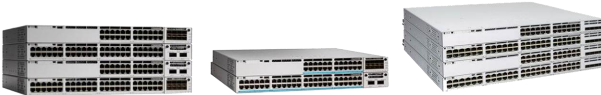
Figure 1. Cisco Catalyst 9300 Series switches

The Cisco Catalyst 9300 Series is made up of nineteen modular uplink switch models and fourteen fixed uplink switch models.